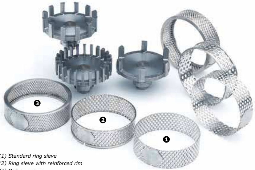
(1) Standard ring sieve (2) Ring sieve with reinforced rim (3) Distance sieve

Temperature-sensitive, brittle materials such as powder coatings and resins are particularly easy to grind with the distance sieves that have been specially developed for this purpose.