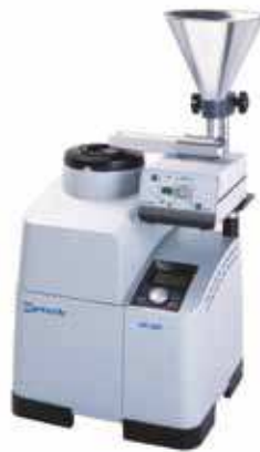
Controlled and uniform material feed: ZM 200 with Vibratory Feeder DR 100