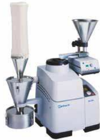
Automatic size reduction of large amounts: ZM 200 with Vibratory Feeder DR 100 and cyclone